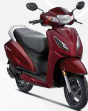
Rebel Red Metallic