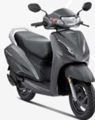
Mat Axis Gray Metallic